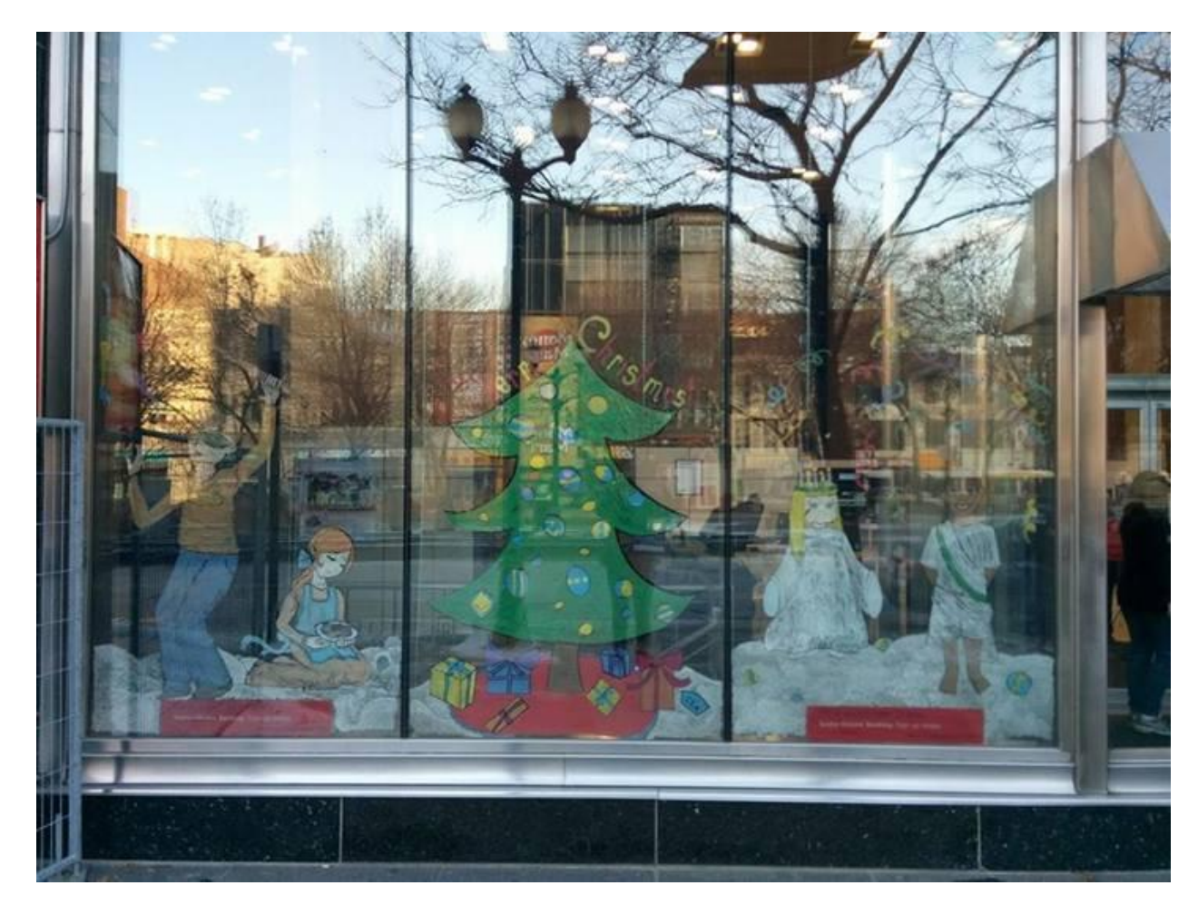
Scotiabank Window Decorating Contest