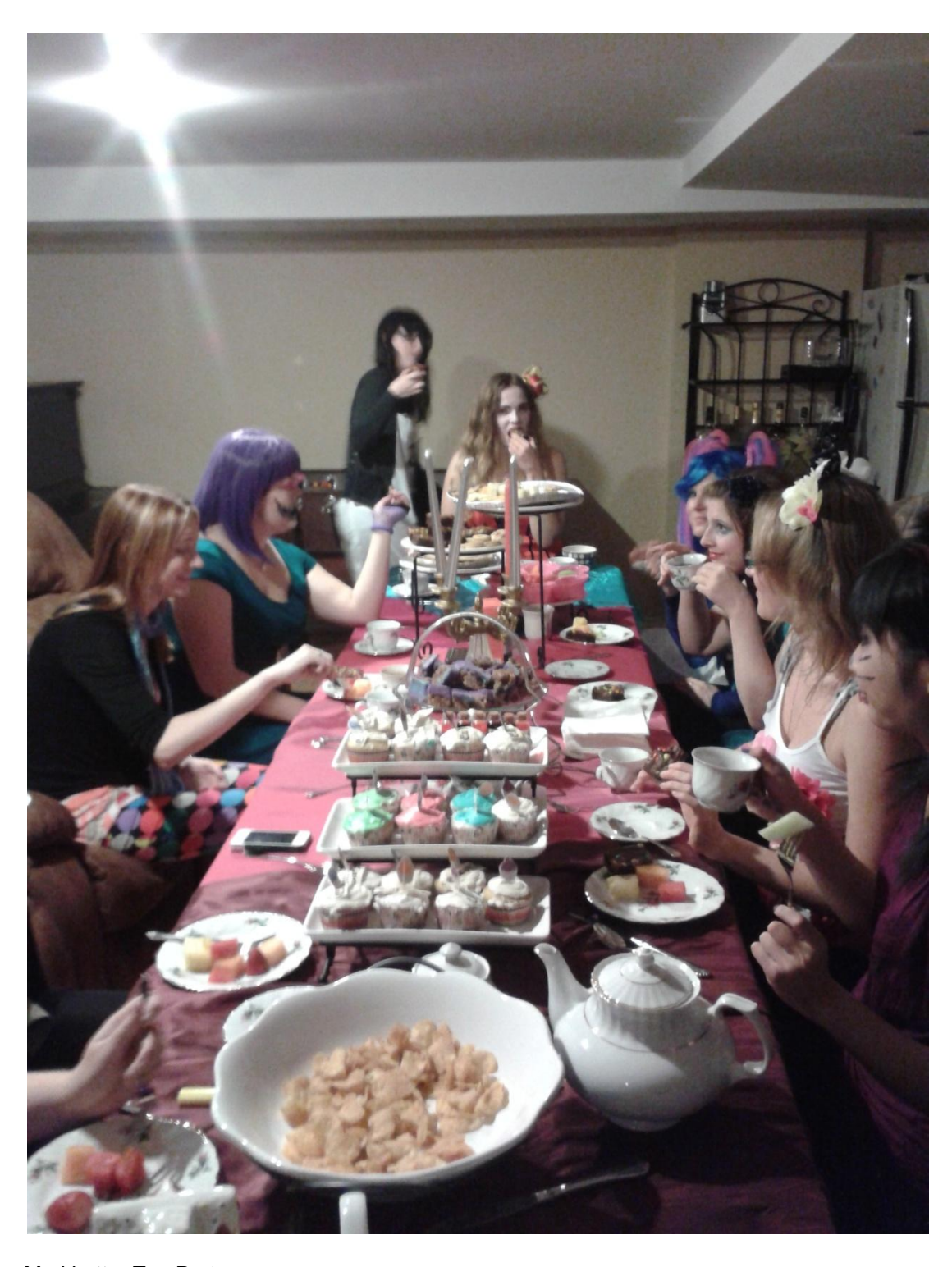
Mad hatter Tea Party