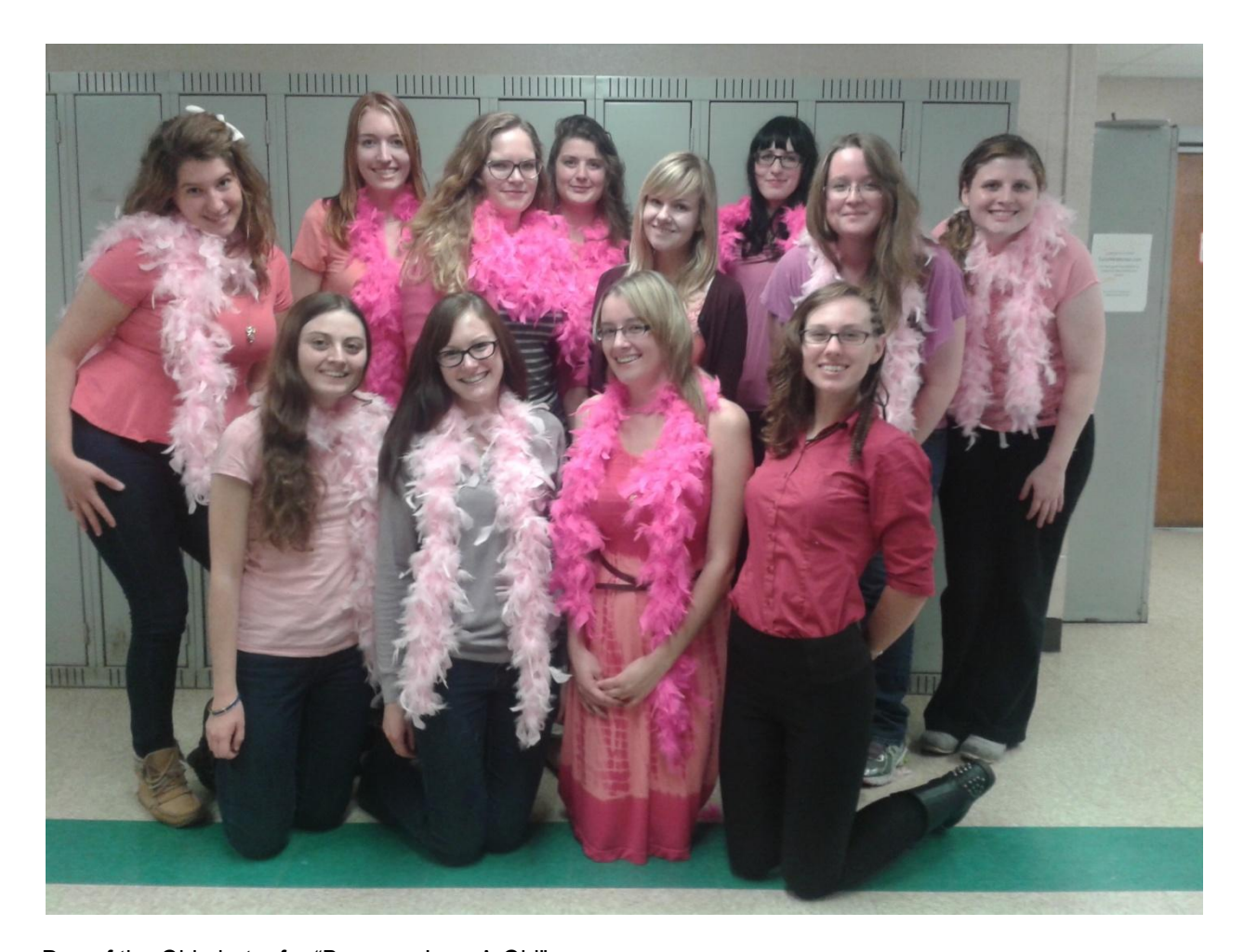
Day of the Girl photo, for "Because I am A Girl"